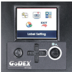
Color TFT LCD and operation panel for easy and intuitive operation

Full functions, powerful features, user friendly interface and high extensibility make the RT700i perfect for retail and industrial applications